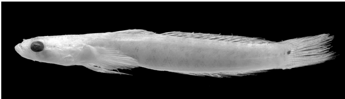
Fig. 1. Xenisthmus chi, holotype, WAM P.28030-033, 20.6 mm, male, Clerke Reef, Rowley Shoals, Timor Sea, Australia.

Description. Dorsal-fin rays VI + I,12, all segmented rays branched; first dorsal-fin pterygiophore formula 3–13110; anal-fin rays I,11, all segmented rays branched; pectoral-fin rays 17/17, upper 1 (2) and lower 1 (2) ray(s) unbranched; pelvic-fin rays I,5, inner ray unbranched; segmented caudal-fin rays 9 + 8; branched caudal-fin rays 7 + 7; upper