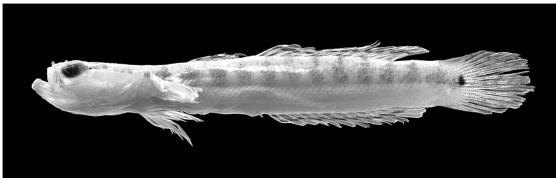
Fig. 3. Xenisthmus semicinctus, holotype, WAM P.28025-048, 19.4 mm, male, Clerke Reef, Rowley Shoals, Timor Sea, Australia.

As thousandths of SL: head length 242 (244); predorsal length 324 (339); prepelvic length 237 (233); preanal length 485 (533); first dorsal-fin origin to second dorsal-fin origin 180 (189); second dorsal-fin base length 335 (322); anal-fin base length 294 (289); pectoral-fin base depth 72 (67); first dorsal-fin origin to pelvic-fin origin 160 (172); second dorsal-fin origin to anal-fin origin 144 (150); snout length 41 (38); orbit diameter 62 (61); head width 160 (133); body width 113 (111); bony interorbital width 15 (11); snout tip to retroarticular tip 113 (111); caudal-peduncle length 175 (183); caudal-peduncle depth 113 (111); length of first spine of first dorsal fin 67 (83); length of third spine of first dorsal