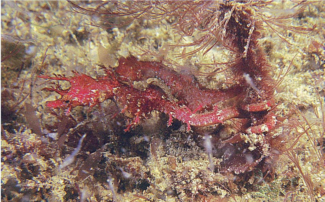
Fig. 2. Idiotropiscis lumnitzeri , male and female, approximately 45 mm TL, Cronulla, Sydney, New South Wales.