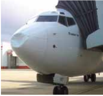
This aircraft collided with a white ibis on take-off.