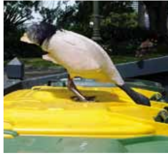
A new use for a long bill.

» If the birds are as mobile as our research suggests, we think there is a risk that nest and egg destruction could affect the total white ibis population because it would reduce the number of birds available to recolonise the traditional breeding grounds once environmental flows to wetlands are restored. Nest destruction may well incite birds to desert a nesting colony, but the empty space might soon be filled by the next breeding pair, wasting management resources.