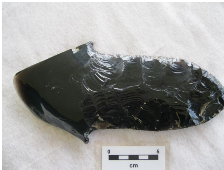
Figure 1 Stemmed tool found at the Barema mill manager's house site (FADP).

The overall aim of our archaeological research in West New Britain was to conduct a series of analyses designed to test the idea that large, elaborately worked obsidian stemmed tools dating from before 7000 up to 3300 years ago represent the earliest evidence for social complexity in the Pacific region (e.g. Cover photo; Figure 1).