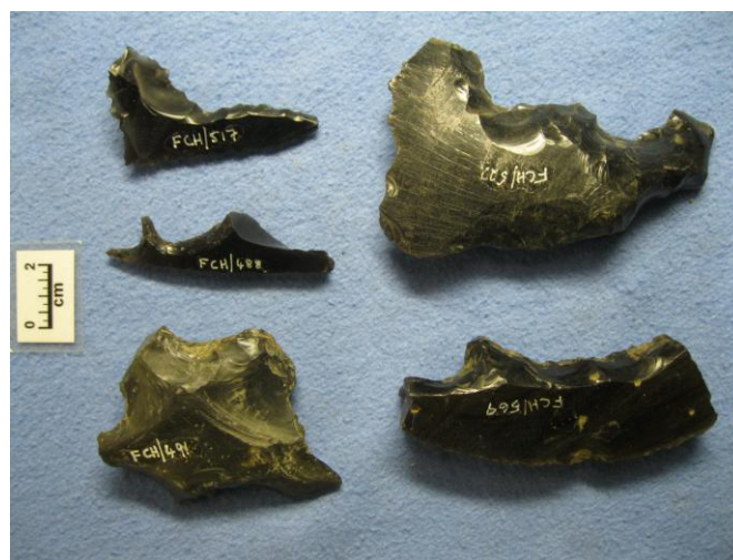
Figure 4 Examples of practice notches made by 'experts' and/or 'novices.'

Based on her experiments, Kononenko concluded that skill must have been a key factor in the production of stemmed tools and that practice would have been an important element in preparing to retouch the large tools, particularly with regard to the preparation of notches. The presence in the Reimann collection of several irregular artifacts from Talasea bearing a series of notches supports this hypothesis, originally proposed by Akerman. A re-examination of the small stemmed tools from FCH has led us to propose the hypothesis that this assemblage resulted from practice and/or training in the manufacture of kombewa flakes and especially in the production of the notches used to create the stem (Figure 4). Since the entire surface collection is geared only to practice, this site may represent a workshop or ritual place dedicated to training in stemmed tool production.