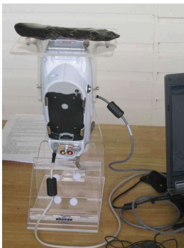
On site PXRF analysis of the newly discovered stemmed tool from Barema, West New Britain