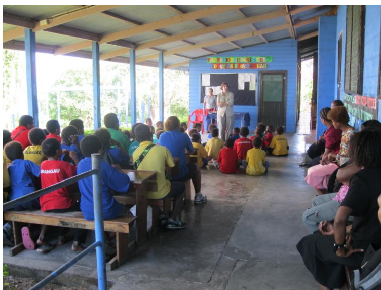
Figure 12 Teaching archaeology at Bialla International School.