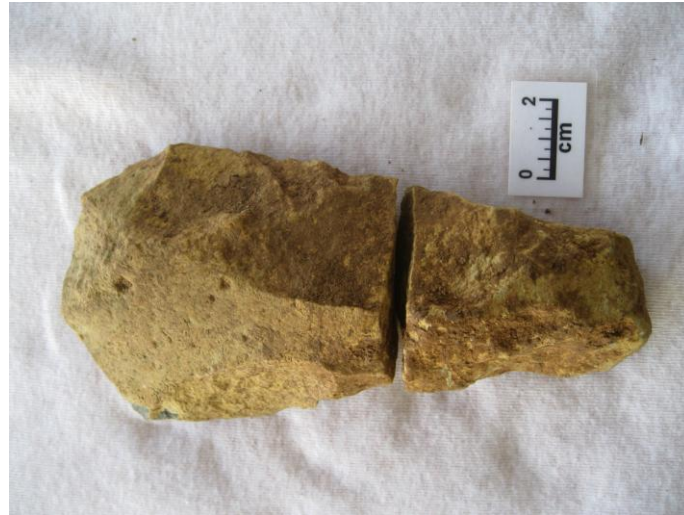
Figure 11 Flaked stone tool from the Barema mill manager's house site (FADP).

Based on consultations with Chris McKee (Geophysical Observatory, Port Moresby), who has done extensive geological fieldwork in the region and who briefly examined tephra samples, photos, and section drawings from the FADP site, it is likely that the very thick tephra unit at the base of the site is Pleistocene in age and the thin orange tephra overlying the brown soil is the Witori W-G unit dated elsewhere to around 1200 years ago. This interpretation of the stratigraphy would confirm the hypothesis that the stemmed tools were derived from the buried soil horizon. A small sample of charcoal obtained from the brown soil in the section (Figure 2) may help refine the dating for the Barema stemmed tools and could therefore contribute greatly to our understanding of large stemmed tools.