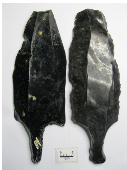
Figure 7 Nearly identical stemmed tools sourced by PXRF to two different sources.

Left: Manus obsidian (76.3.141 Site GGI on Lou Island, Manus).