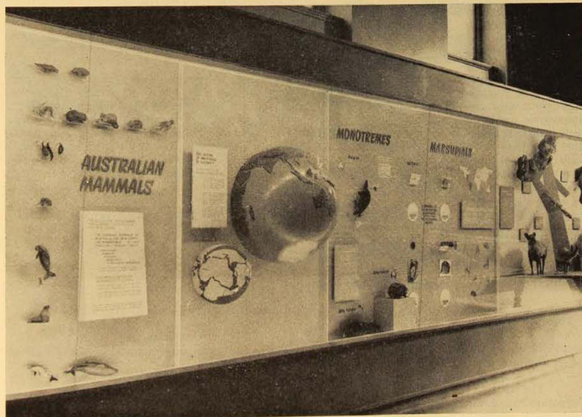
Part of a new display of Australian mammals