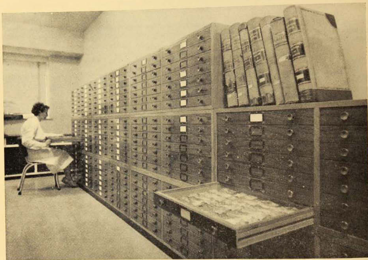
New insect cabinets in the Department of Entomology

Progress has been made in transferring part of the pinned collection of insects to new cabinets made available during the year. The spirit collection is also in process of being re-organised and a start has been made with the re-arrangement of the slide collection.