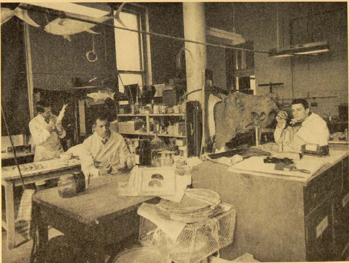
A preparators' workshop