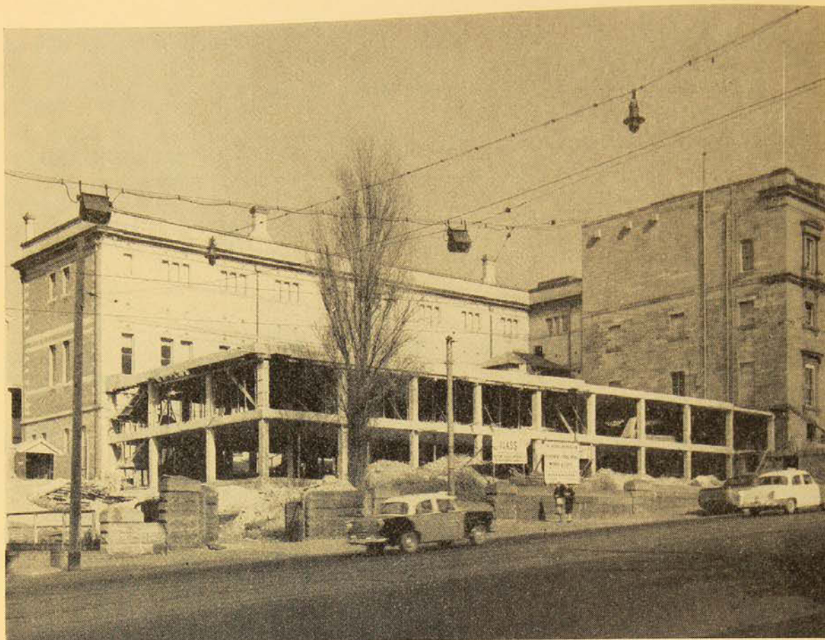
The new wing under construction